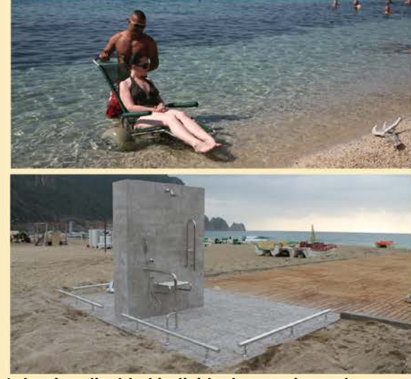
1- Letting disabled individuals to swim under supervision of attendants

TR61/11/TURIZM/KAMU01-31, which is sponsored by the Western Mediterranean Development Agency (BAKA) under Financial Support program for 2011 and will be completed within eight months, comprises works and activities to be carried out on Kleopatra and Keykubad beaches in central Alanya. The project aims to ensure services of high quality on beaches in Alanya which annually hosts three million visitors in average while ensuring their satisfaction. It will also contribute to the promotion of our region and extend the tourist season. The quality of services offered by businesses and kiosks on the beach will have been increased and their preferability will have been increased through the project. The project consists of three main activities.